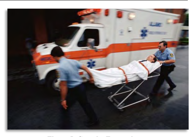
Figure 5: Casualty Evacuation

An Active Shooter attack significantly impacts a business' ability to resume operations. Business continuity planning and preparedness