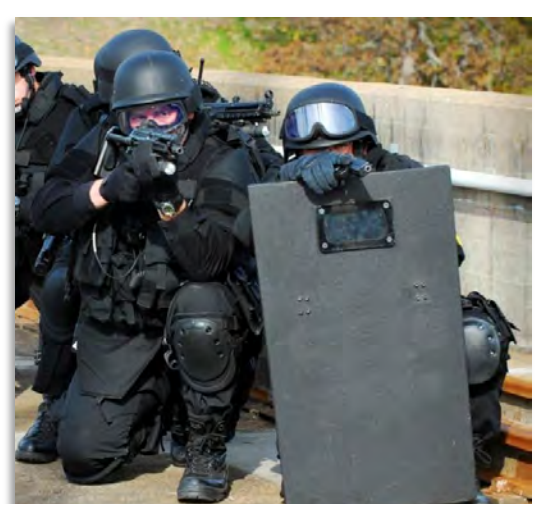
Figure 4: Active Shooter Special Response Team

Establishing marshaling and accountability procedures, including designation of assembly areas are best practices. Assembly areas should be clearly identifiable, secure, concealed from an Active Shooter's line of sight, and ideally provide substantial