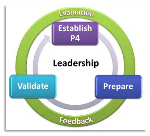
Figure 2: Programmatic Framework

To best prepare employees for an Active Shooter attack, organizations require an enterprise-wide protection program that is based on a firm foundation of P4 and preparedness activities