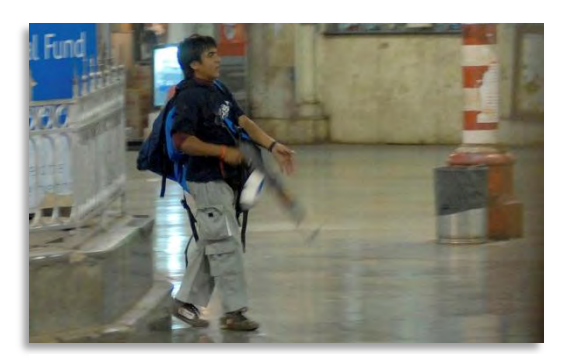
Figure 1: Active Shooter in a Railway Lobby

An Active Shooter is the most dangerous workplace violence threat, rivaled only by a suicide bomber – a similar threat with which it shares many traits. The costs associated with Active Shooter attacks are quantifiable, in terms of lost lives, operational disruption, outage time, workers' compensation, medical expenses, and resulting litigation. Intangible costs include reputational risk, psychological trauma, and loss of employee trust, sense of community, security, and productivity.